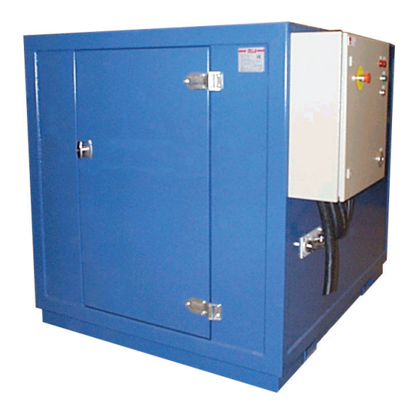
The PES-2S unit shall always be connected to a filter separator to complete a vacuum system